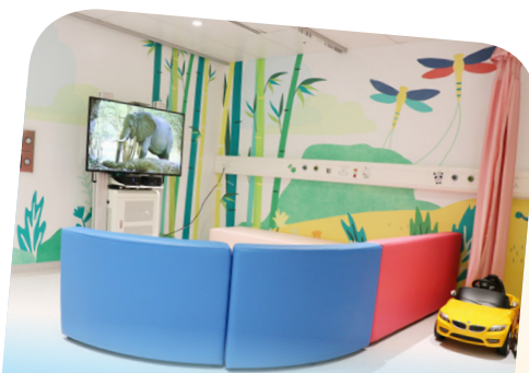
色彩繽紛的接待處 A colourful reception area