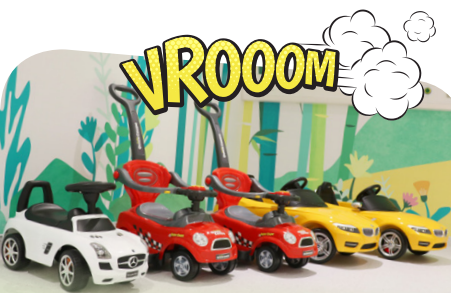
病童化身小小賽車手 Be a little street racer

團隊特別將手術室內的四條主要走廊命名為「樂迎街」、「花悅街」、「喜舞街」和「安琪兒街」。若病況許可，病童更可在「停車場」選一輛電動玩具跑車，親自駕駛到手術室。