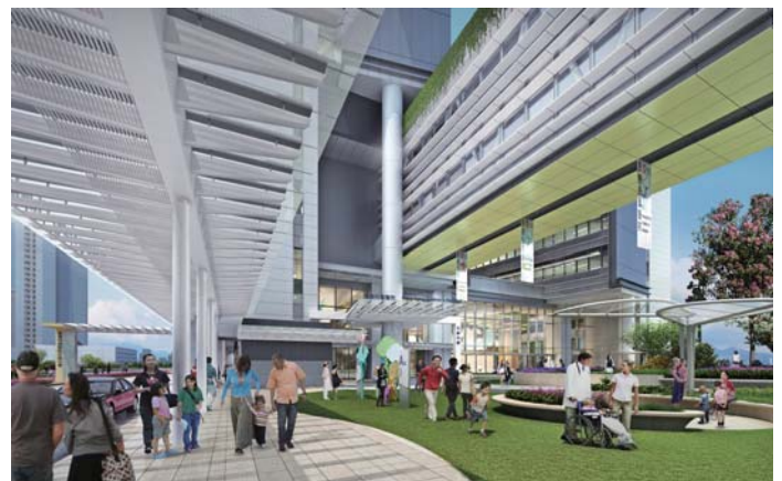
A welcoming atmosphere at the Hospital entrance.

Being the first purpose-built hospital for our children in Hong Kong, the overall design objective of the Hong Kong Children's Hospital (HKCH) is to create a home-like and child-friendly environment that provide an uplifting healing experience to our sick children. A pleasant and soothing atmosphere is aimed to relieve the tension and stress from the sick children and their carers.