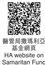
醫管局撒瑪利亞 基金網頁 HA website on Samaritan Fund