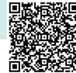
HA Go 醫療費用援助網頁 HA Go website on Medical Fee Assistance

市民可利用醫管局網頁或流動應用程式HA Go內的經濟審查計算程式，自行初步評估家庭財務狀況是否符合醫療費用減免和撒瑪利亞基金安全網申請資格。